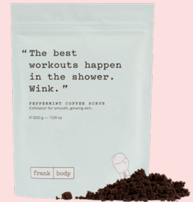
PEPPERMINT COFFEE SCRUB $18.95

Like a cappuccino, this scrub combines coffee grinds with organic cacao extract to hit babe's sweet spots. Rich in antioxidants, everyone will want a piece of this.