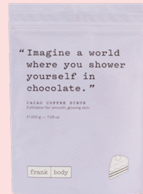
CACAO COFFEE SCRUB $18.95

When they need an island vacation, but they've used up all their leave. . Nut-free for sensitive skin, with coconut oil and jojoba beads for a year-round vacation glow.