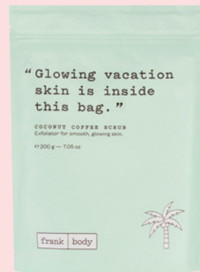
COCONUT COFFEE SCRUB $18.95

Three coffees before midday? My Original Coffee Scrub will wake your staff up on the outside too: it's the scrub that made me famous. With coffee grinds, cold pressed sweet almond oil, vitamin E, and sea salt to scrub tired or wired skin.