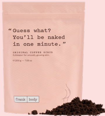
ORIGINAL COFFEE SCRUB $16.95

Three coffees before midday? My Original Coffee Scrub will wake your staff up on the outside too: it's the scrub that made me famous. With coffee grinds, cold pressed sweet almond oil, vitamin E, and sea salt to scrub tired or wired skin.